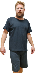
YSHIELD® TBT + TBH