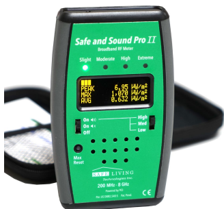
YSHIELD® Safe and Sound Pro II