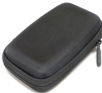
YSHIELD® Safe and Sound Pro II